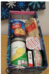
Shoe box ☺ no more than the required item