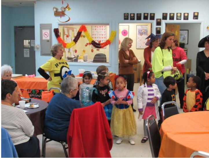
Kid's Kingdom Participates in Halloween Fun with Clarkstown/Pearl River Senior Center!