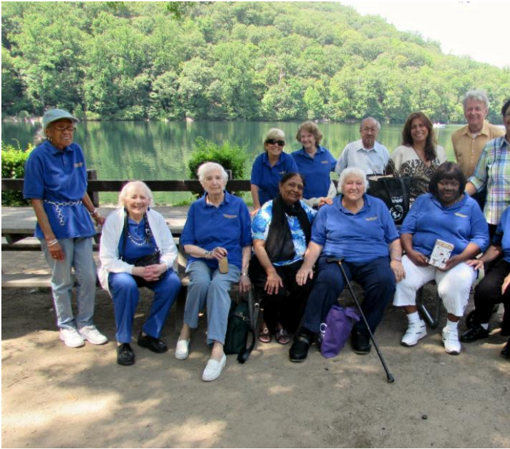
Meals On Wheels Ramapo Senior Center members and staff enjoy a day out at Bear Mountain.

Members of Meals on Wheels Ramapo Senior Center enjoyed a beautiful day out earlier this month at Bear Mountain State Park. Please click here to learn more about what our five senior centers located throughout the county offer participants.