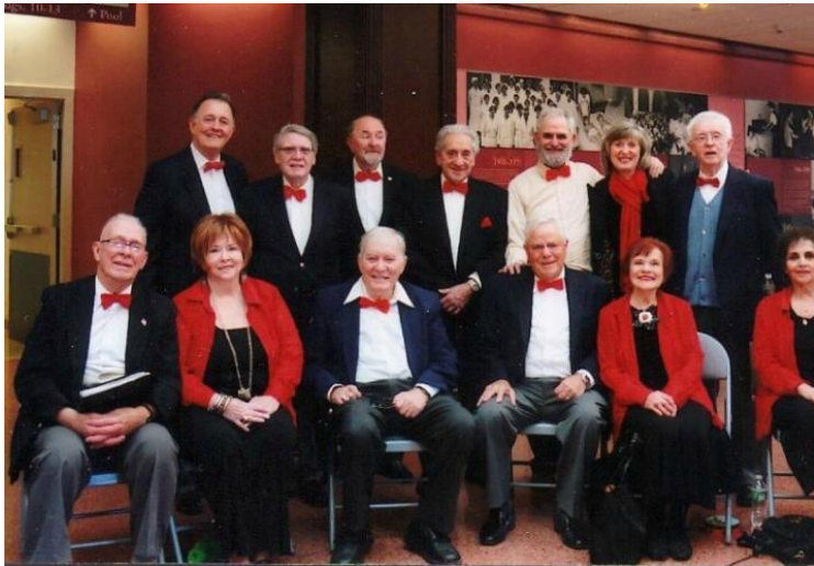
The Music Makers of Rockland County