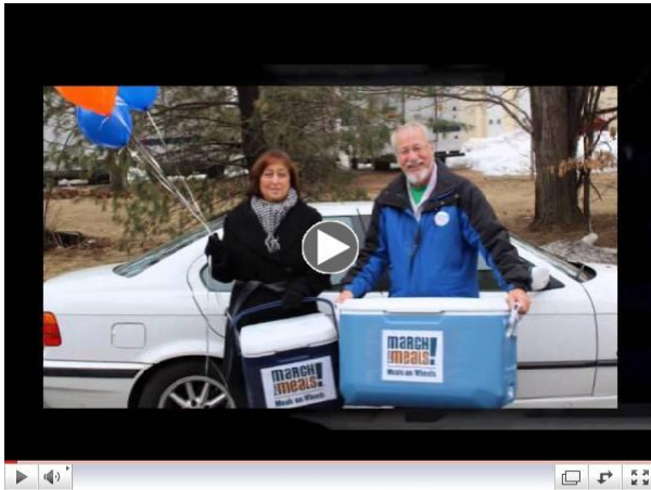
2014 March for Meals