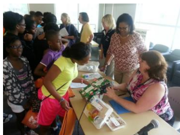
Hudson Youth Leadership Academy Event