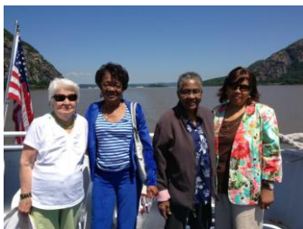
Seniors from the Nyack Senior Center Enjoy the Pride of the Hudson Boat Trip

Many of our Meals on Wheels Senior Center participants recently enjoyed a day of cruising the Hudson aboard the Pride of the Hudson . Our Centers love to take seniors on great trips!