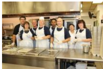
Capital One Associates Volunteer in the Commissary

Capital One Financial Corporation generously supports the agency in more ways than one. Not only has Capital One donated $5,000 in support of the agency's Homebound Meal Delivery Program each year for the past several years, but the company has also loaned the agency valuable staff members to help prepare meals and then deliver those meals to seniors and others in need during the Company's national community service initiative in October. The agency is very grateful for Capital One's continued support over the past several years.