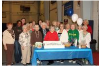
North Rockland Seniors & Staff at New Home